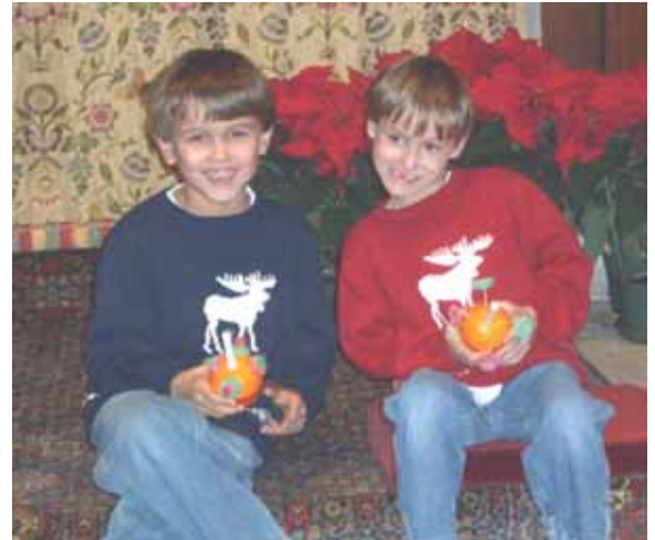
A couple of fellas at Christingle

- Sunday and weekday where possible. If everyone who loves St John's made worship life a priority for them and their family we could have even more in Church. We live in a mobile community, a commuter community, a community where people have homes in different places and where there are many opportunities for sport and leisure. TOGETHER though we need to ensure that we ALL do what we can to be at regular worship and to bring others and encourage others to worship. Worship cannot be relegated to a leisure time occupation. Like prayer it should be the source and ground of our life and work. There is a lot of good will towards this Church, a lot of people who come twice a year and who feel it is 'their' Church but we need to move to getting much greater commitment by bodies present in worship. WE are all equally responsible for that. Jesus said 'Go out and spread the Good News'. Part of the Good News here is that we have a believing community that is open to all and wants to develop, expand and grow because it believes the Lord is with us, has risen from the dead and He is infinitely worth celebrating and worth worshipping